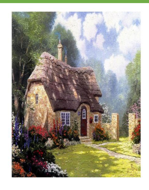
This is a cottage. Do you know a story with a cottage like this in it?

This is a castle. Which story do you know which has a castle?